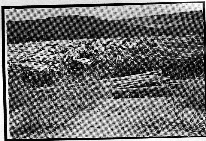
Daishowa's Peace River mill log yard located just outside of the unceded traditional territory of the Lubicon Nation.

Industrial development devastated Lubicon society and its subsistence economy. Moose, the staple of the Lubicon diet, fled the area, along with most of the smaller animals which formed the basis of the trapping trade. The Lubicon experienced increased alcoholism, birth defects which the Lubicon had never seen before, suicides, a tuberculosis epidemic and other serious medical problems. Meanwhile, gas and oil companies profited more than $8 billion in revenues from their operations on Lubicon land. To date the Lubicon have not received a cent of oil or gas royalties. The community lives in extreme poverty, and many Lubicon homes are over-crowded, have no running water, and lack adequate sewage disposal.